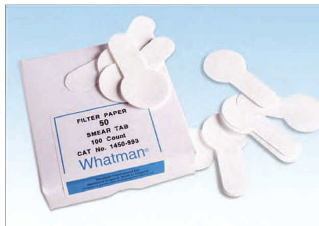
Surface Wipes – Smear Tab