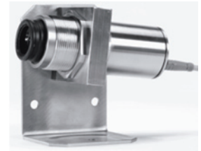
Sirius Mounting Bracket HA11

Scope of supply: Sensor with lens, 2 mounting nuts M40 x 1.5 and Manual. Connecting cable with Software has to be ordered separately