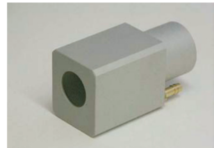
Sirius Cooling Housing KG60

Scope of supply: Sensor with lens, 2 mounting nuts M40 x 1.5 and Manual. Connecting cable with Software has to be ordered separately