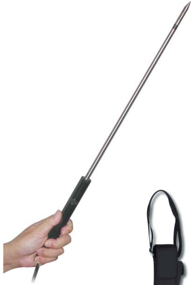
Probe, MS-71P ( included )