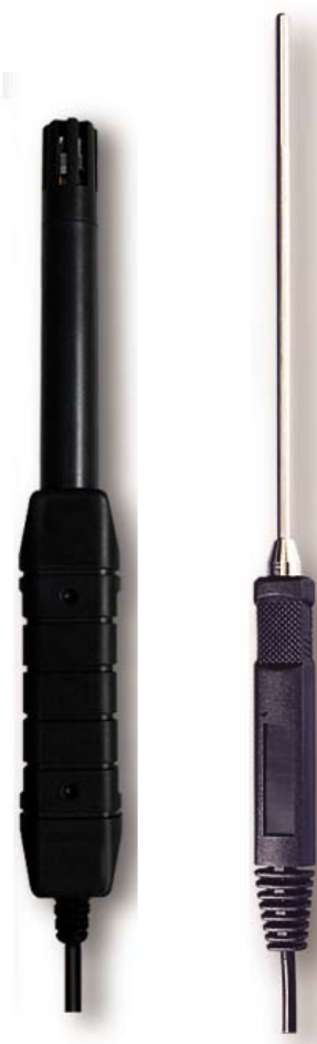
Temp. probe is optional