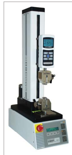
Shown with an ESM301 test stand and G1061 wedge grips

On-board data memory for up to 50 readings is included, as are statistical calculations with output to a PC. Integrated set points with indicators and outputs are ideal for pass-fail testing and for triggering external devices such as an alarm, relay, or test stand. The gauges are overload protected to 150% of capacity, and an analog load bar is shown on the display for graphical representation of applied force.