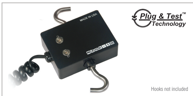
Hooks not included

Series R03 smart sensors are designed for tension and compression measurement applications in virtually every industry. Threaded holes on two sides can accept a variety of hooks and implements, making this sensor particularly well suited for inline tests. Capacities available from 0.25 to 100 lbF [1 to 500 N]. Compatible with Mark-10 indicators (sold separately) through unique Plug & Test™ technology.