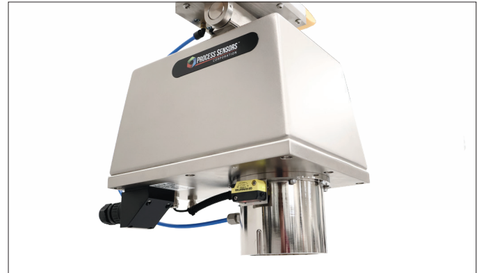
Guardian-HD sensor finished with food grade electroless nickel