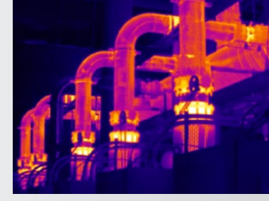
MultiSharp™ Focus produces an image