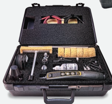
Complete Kit shown