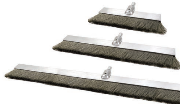
Flat Wire Brush Electrodes