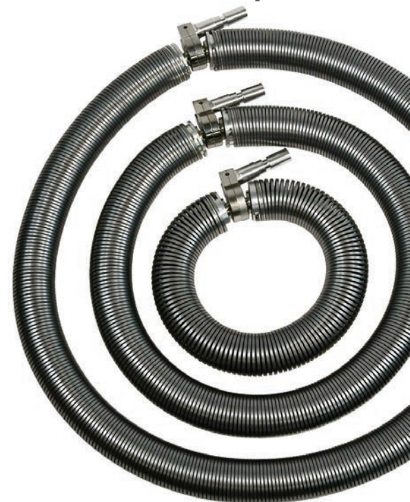
Rolling Spring Electrodes

† The PosiTest HHD is compatible with SPY coils, brushes and accessories.