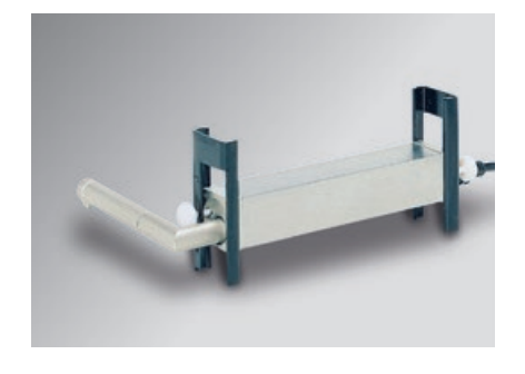
DT57707 extension adapter The 90° offset extension enables lateral probing