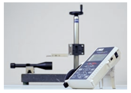
SURFCOM FLEX Compact control and analysis unit with integrated printer and Excel-based evaluation software