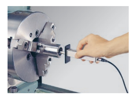
E-WJ-S86A orthogonal attachment Alignment aid for reliable alignment at right angles to the bearing surface