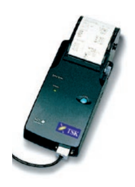
High-speed thermal printer with high resolution