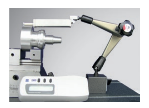
Magnetic column with ball joints Flexible magnetic columns with two ball joints and one swivel joint