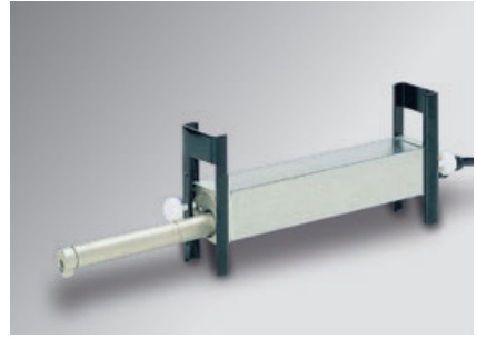
DT57506 extension Extension of the sensing arm by 50 mm, e.g. for measuring deep boreholes